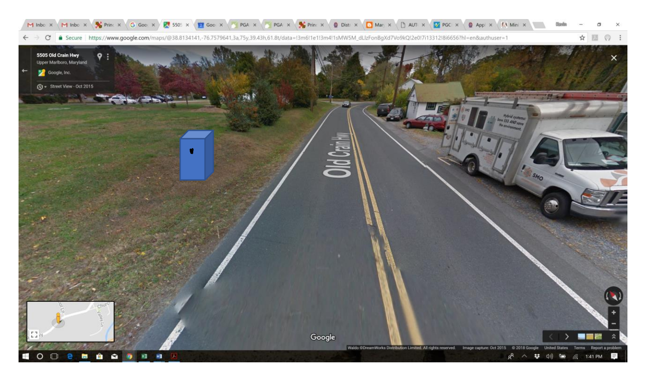
Exh. B - Old Crain Highway (Eastbound) near proposed site of SMS (blue box) on Parcel 49 on left shoulder of roadway.